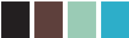
Colour specifications of the Iris Reconstruction Implants

Ophtec's Iris Reconstruction Implants are available in black, brown, green and blue. These colours have been carefully chosen to simulate the natural colouring of most eyes.